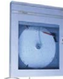
CHT - 5000PT Third party pressure test with calibrated test equipment