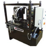
PP1 - 11 Kw 3 Phase Power Pack 56 L.P.M up to 100 bar remote Pendant