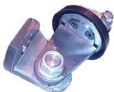
LSFH4 - LSFH36 Line stop folding heads 4 - 24"