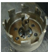
HTC3EX - HTC36EX Extended hot tap cutters from 3 - 36"