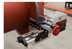
MM1000i-22 Heat Exchanger Back Facing Kit