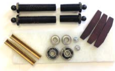
MM1000i-SK 2 years Recommended Spares Kit