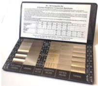
RBC0130 Surface Comparator – Multi Discipline