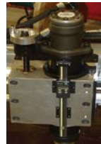
MM1000i-10 Hydraulic Orbital Milling Kit