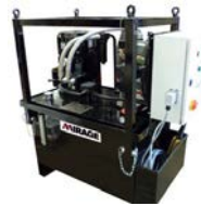
PP1 11 KW 3 phase power pack - 56 L.P.M up to 100 BAR