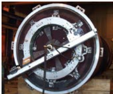
MM1000i-7 Heat Exchanger Mounting Plate Kit