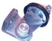
LSFH4 - LSFH36 Line stop folding heads 4 - 24"