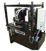
PP1 - 11 Kw 3 Phase Power Pack 56 L.P.M up to 100 bar remote Pendant