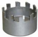
HTC3 - HTC36 Standard hot tap cutters from 3 - 36"