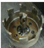
HTC3EX - HTC36EX Extended hot tap cutters from 3 - 36"