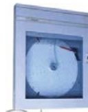
CHT - 5000PT Third party pressure test with calibrated test equipment