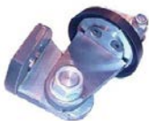
LSFH4 - LSFH36 Line stop folding heads 4 - 24"