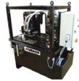
PP1 - 11 Kw 3 Phase Power Pack 56 L.P.M up to 100 bar remote Pendant