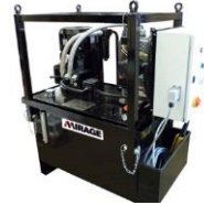
PP1 11 KW 3 phase power pack - 56 L.P.M up to 100 BAR