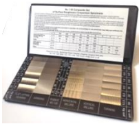
RBCO130 Surface Comparator – Multi Discipline