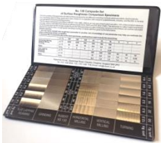
RBC0130 Surface Comparator – Multi Discipline