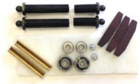
MM200e-SK 2 years Recommended Spares Kit